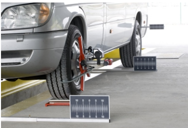
Upgrade Kit for cars and light trucks